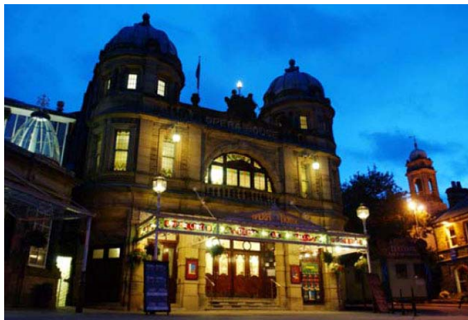
Buxton Opera House

Opera, literature and music in a beautiful country spa town dating from the late 1700s. On average 6 events per day with 100 during the festival and 40,000 visitors.