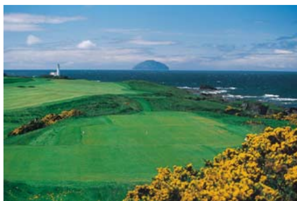
Turnberry Kintyre 9th