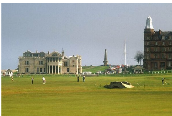
St. Andrews Old Course