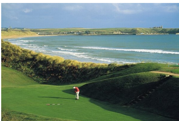
Cruden Bay Golf Club

There are some restrictions on these courses, subject to handicap and availability. A handicap certificate might be required together with a letter of introduction. Advanced booking is required.