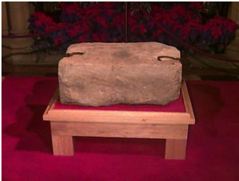
Stone of Destinu