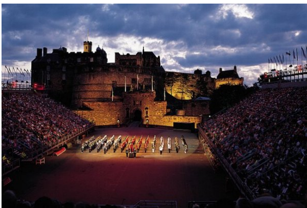
Edinburgh Military Tattoo

In the late summer for three weeks every year this is the world's largest art festival with 450,000 visitors. The best in international theatre, music, stand-up comedy, jazz, film, television, dance and opera. The Edinburgh Tattoo with pipe bands and Scottish infantry battalions; the Edinburgh Book Festival has 500 authors discussing their ideas. The Festival Fringe provides a window on innovative theatre providing 28,000 performances of 1800 shows in 260 venues.