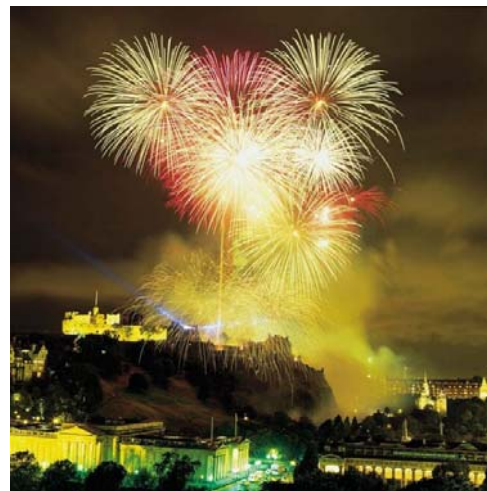
Edinburgh Castle Fireworks