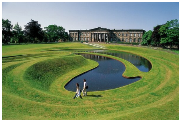
Gallery of Modern Art