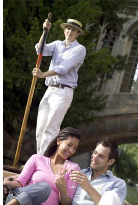
River Cam, Cambridge