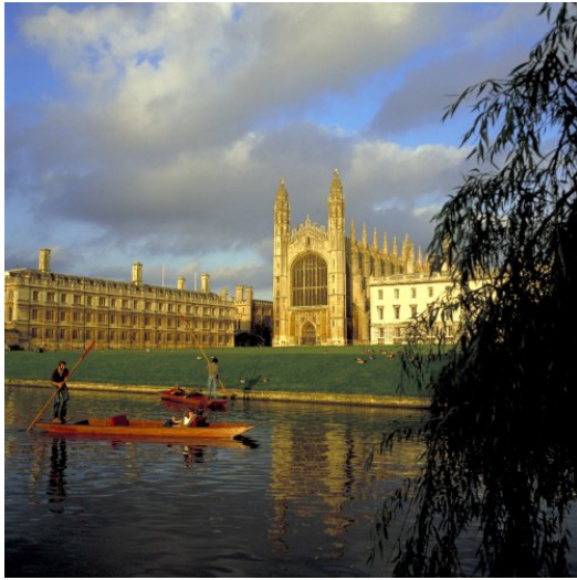
Kings College Chapel, Cambridge