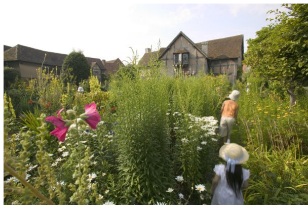
Shakespeare's Birthplace, Stratford-upon-Avon