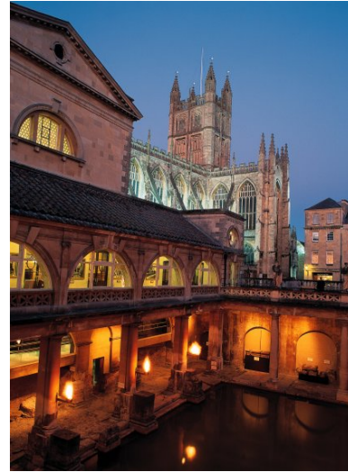
Roman Baths, Bath