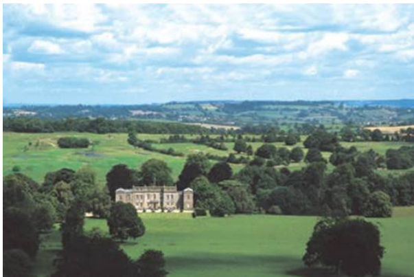
Ston Easton Park