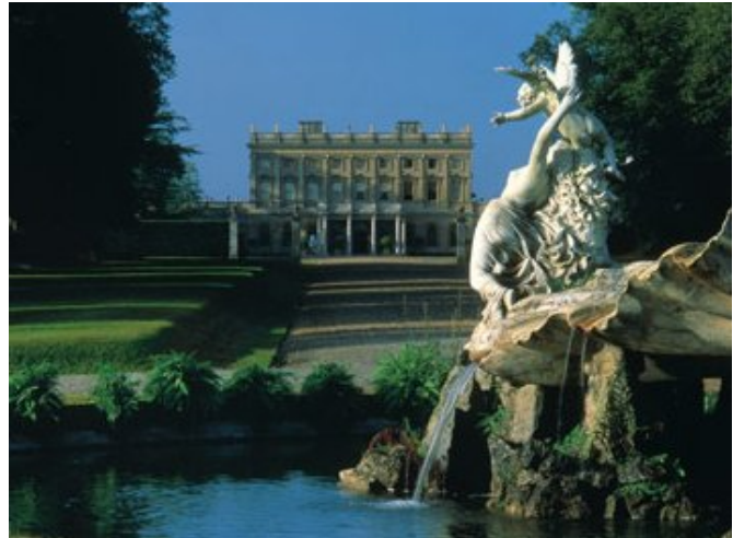
Cliveden House Hotel

World famous, very refined, classic and modern, surrounded by herb gardens, Japanese ornamental. Luxurious rooms. Restaurant (Raymond Le Blanc) is one of the best British restaurants.