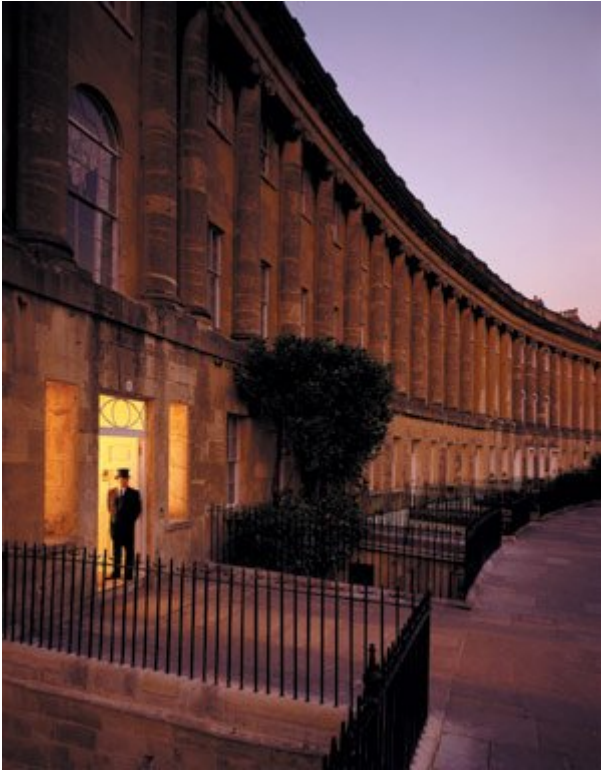
The Royal Crescent