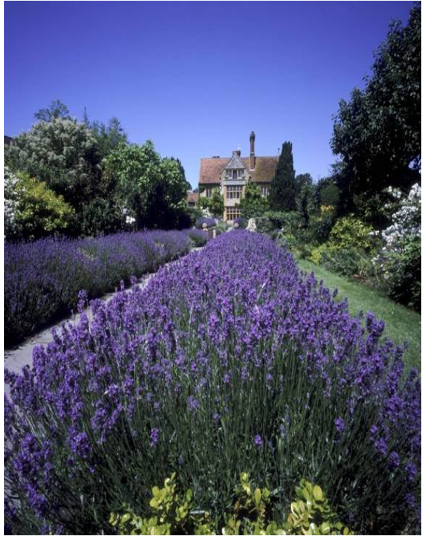
Le Manoir aux Quat'Saisons