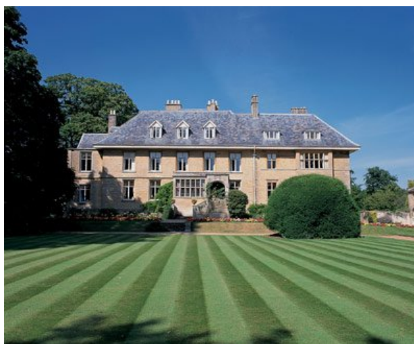
Lower Slaughter Manor